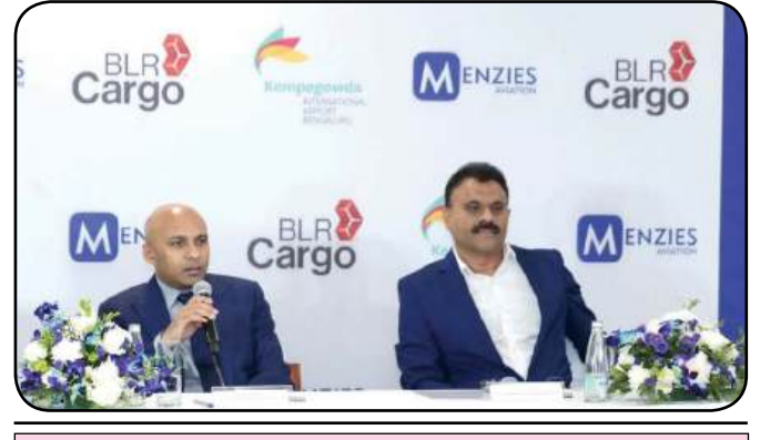
Appointments - 4, 9

This 245,000 square feet state-of-the-art facility sig Continued on page 10