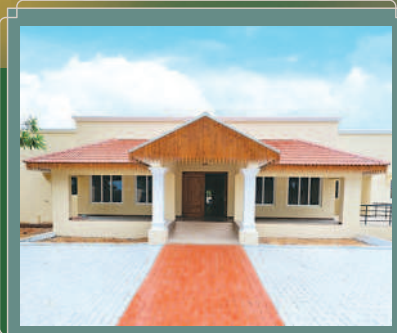
A.M.M. Hospital, Pallathur A unit of A.M.M. Foundation

Popularly called the One Rupee Hospital, the A.M.M. Hospital signaled our intent to give back to society. And over the last 100 years, the A.M.M. Foundation, the CSR-arm of the Murugappa Group, has single-mindedly focused on this mission. By building hospitals for better healthcare. Taking basic healthcare to remote villages. Establishing schools and a polytechnic for accessible education. Giving rural students their first experience of a science lab. Running a Research Centre to enhance rural livelihoods. Developing a football academy to enable progress. Rejuvenating lakes in parched lands. And more.